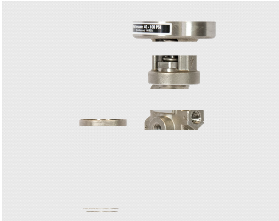
Durbin Industrial Valve 4-Way Spool Valves